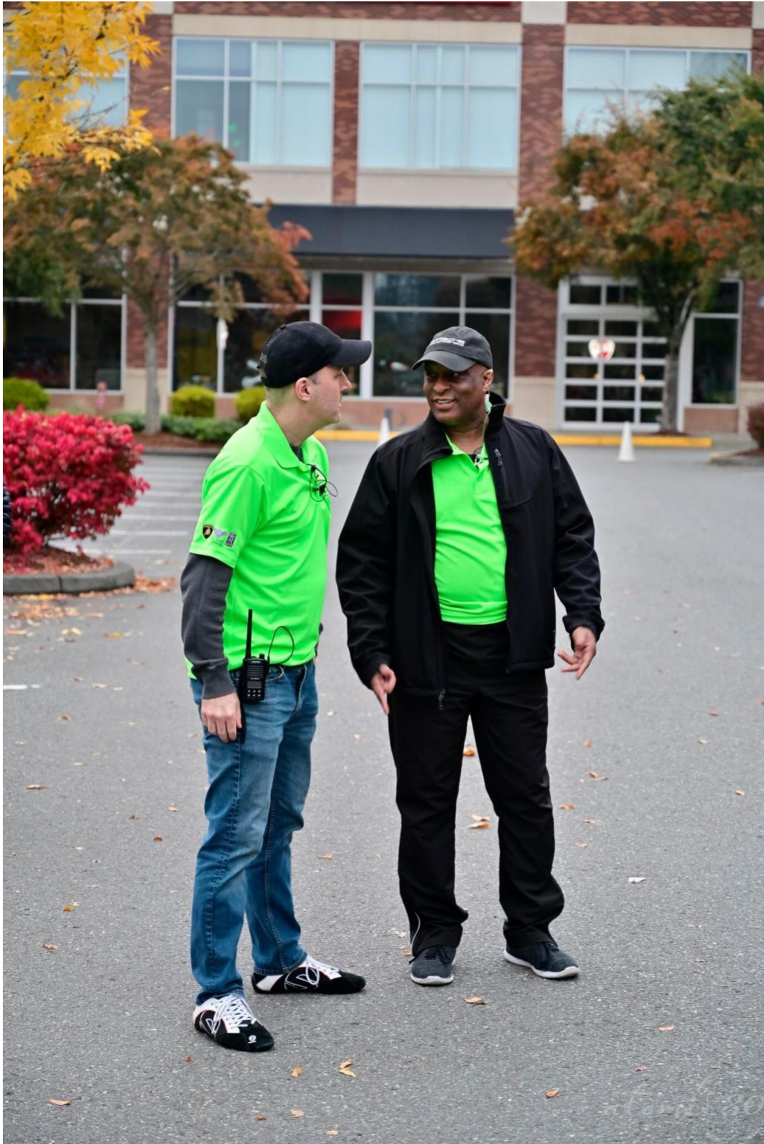
"Level with me, did I get my text message right? Are we really on or is it just the two of us?"