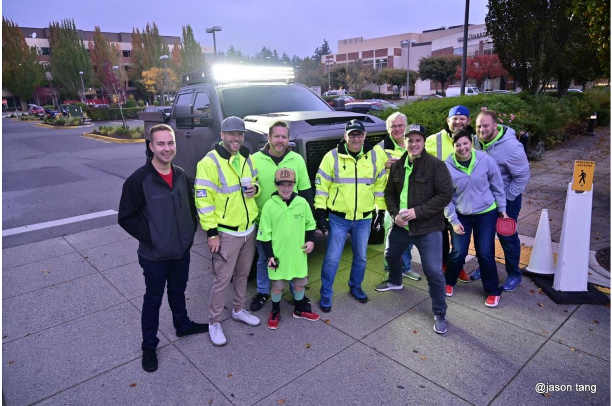
About to kick off Season Eleven on a cold morning...