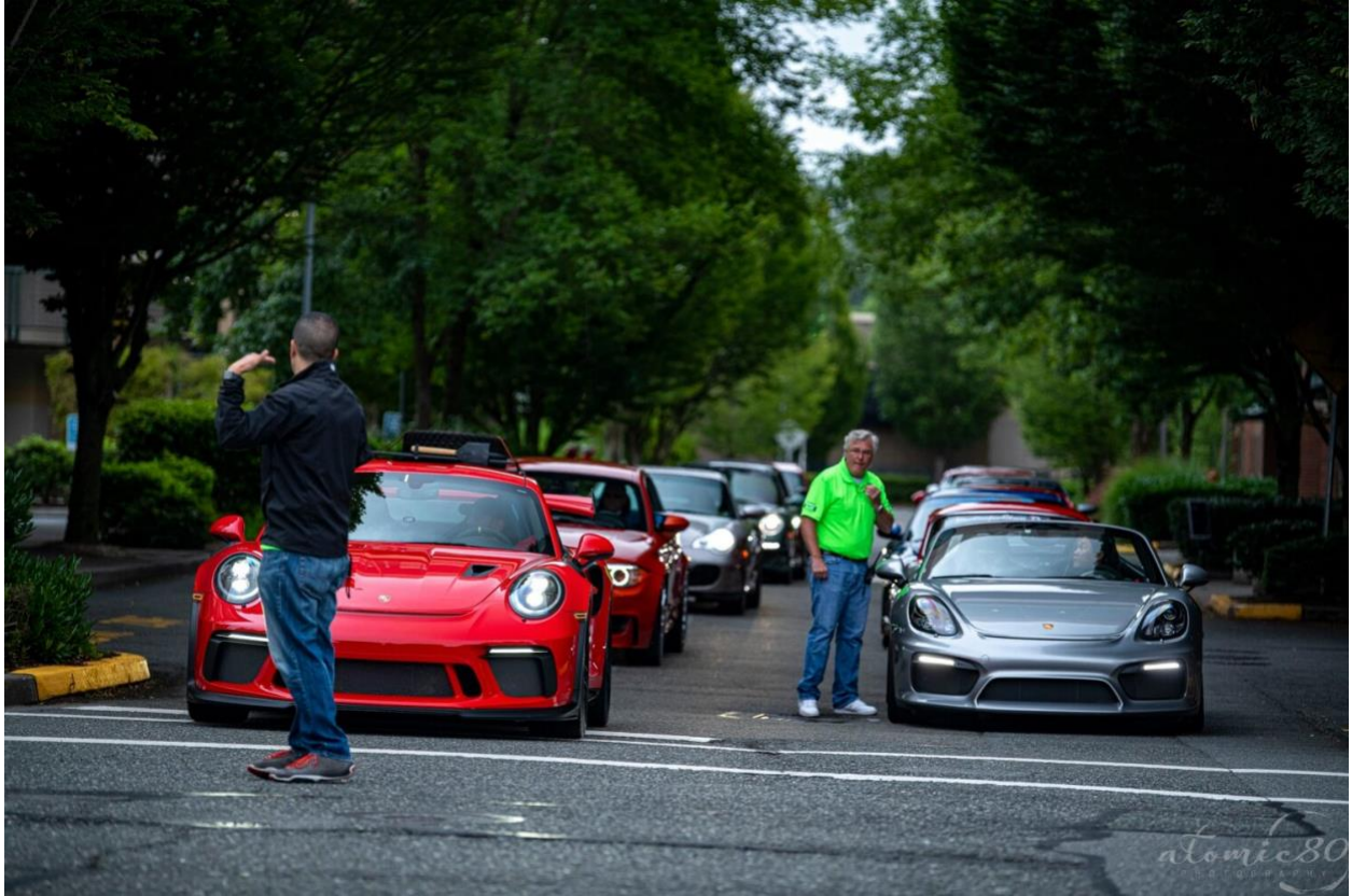
"You know that guy could park if you'd just move..."