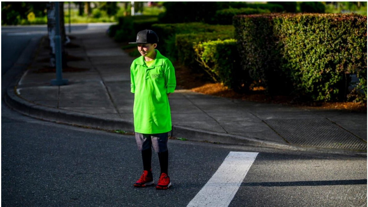
Lincoln thinking about all the cars he'll own someday...and the butts he'll kick...