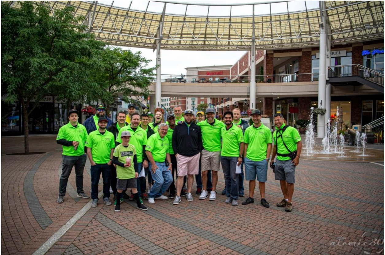
Most of us this season...