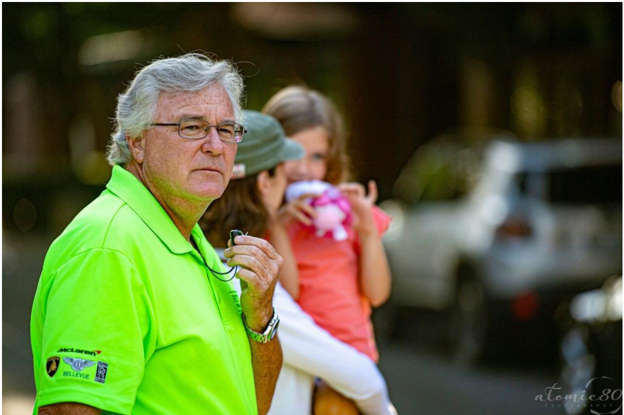
"I shouldn't have let that guy in..."