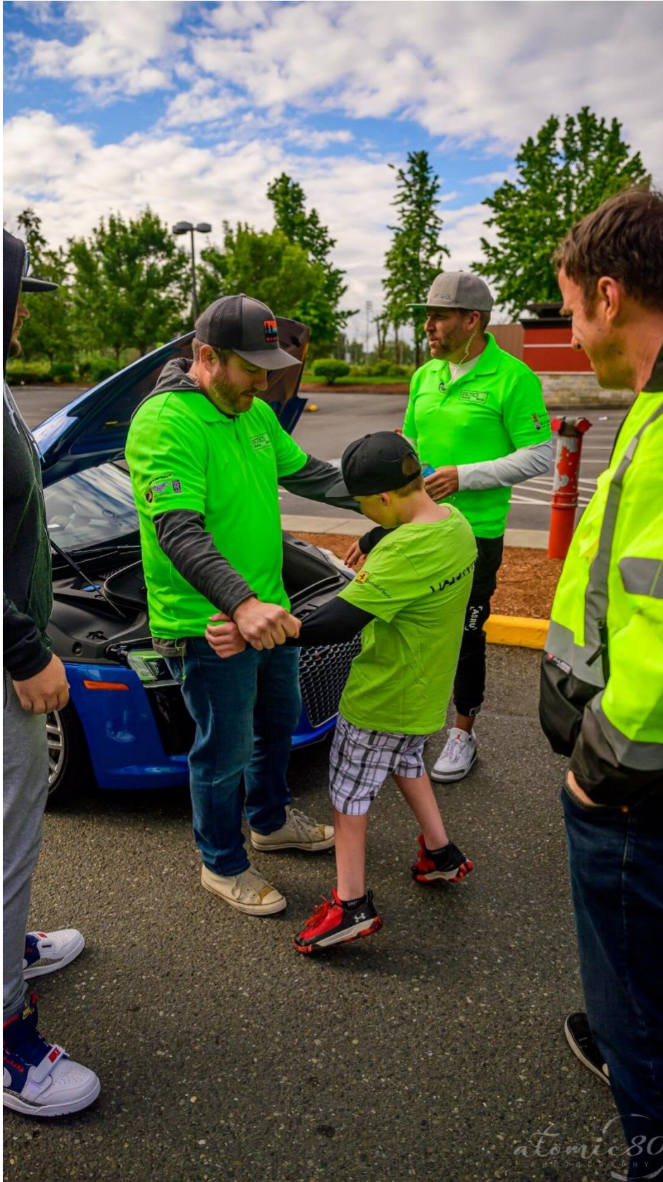
"Then when you have him like this, give him a good shot in the bean bag..."