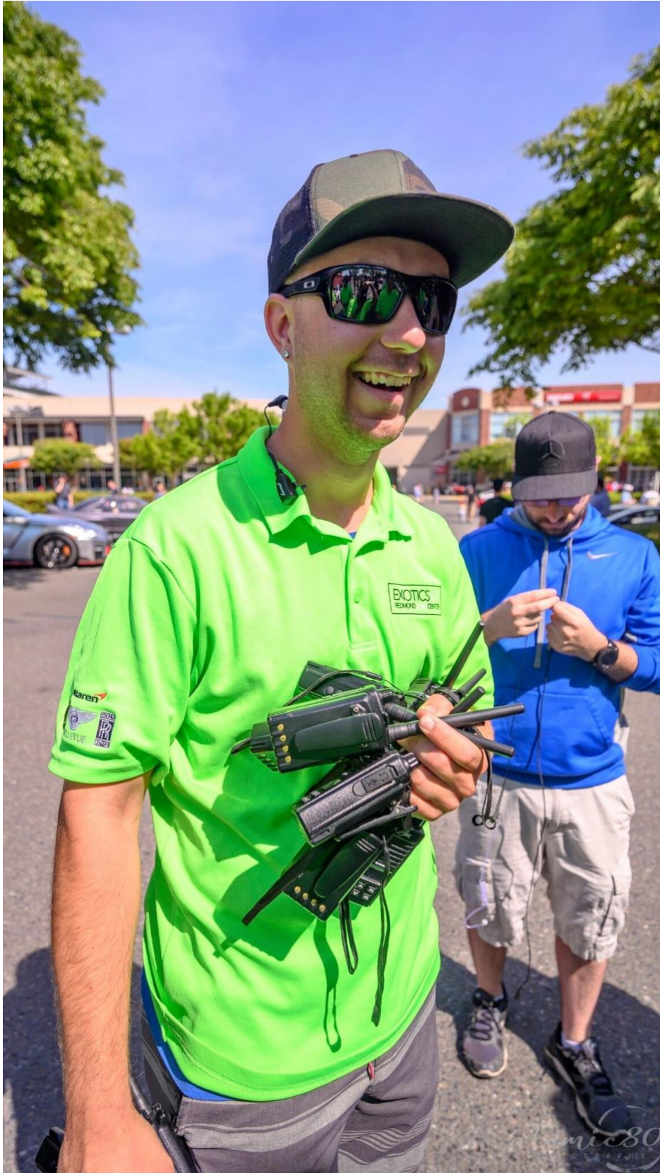
"You get a radio, and YOU get a radio..."