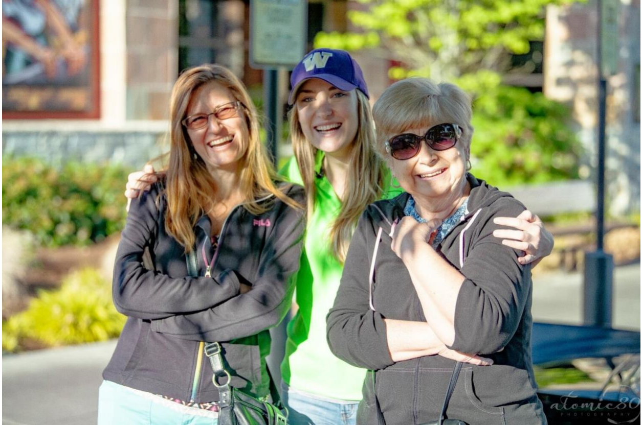
When family comes to check your work...