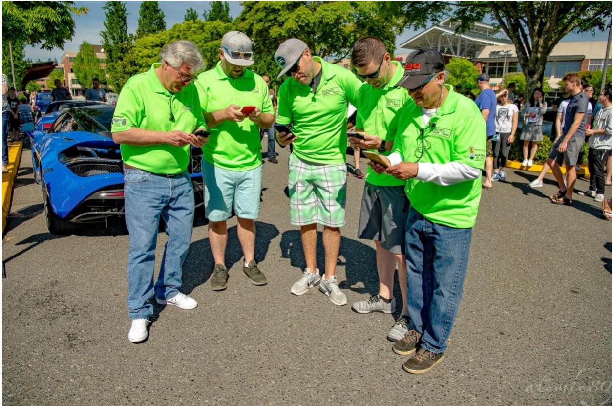
"Swipe left..., no that should have been a right"