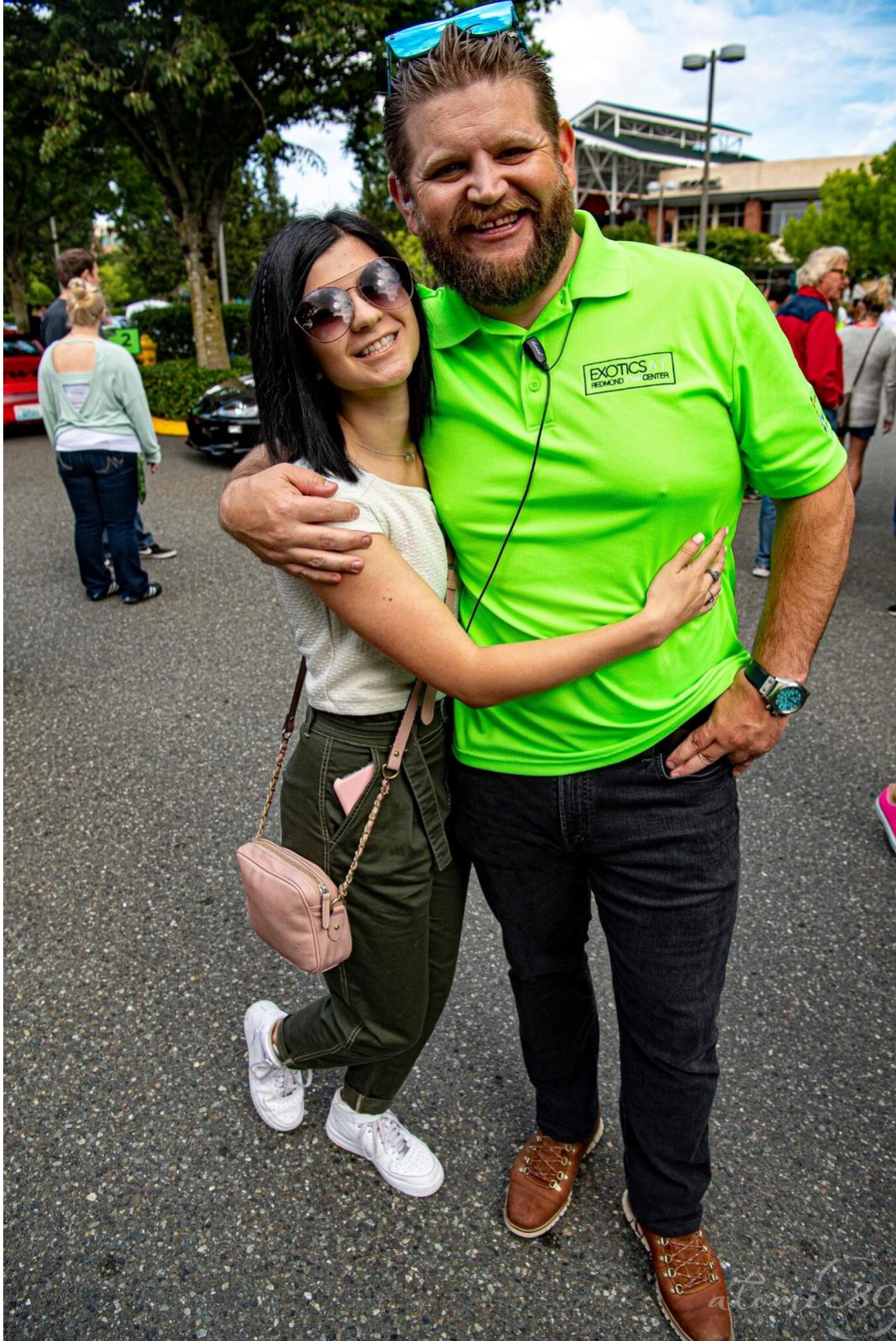
Honey Badger comes to pay us a visit. We sure miss you!